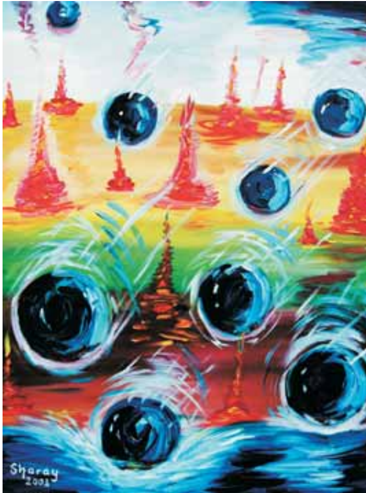
Sharay 2003, "Strange Worlds...?!"