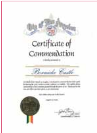
City Los Angeles, letter for "Artists to Artists Germany 2005"

To finance the realization of the international artists meeting numerous sponsors are required. The development association and the artists agency succeed to receive a large part of financial resources.