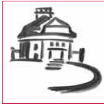
The association of support Börnicke Palace and Estate