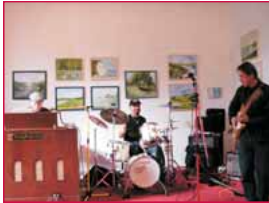
Börnicke Castle exhibitions and jazz concerts 2004

2004 the development association organized the following events: