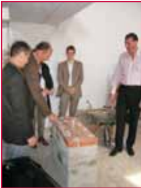
05/29/2005 laying of the foundation-stone for the Automobile Museum, Börnische Castle Grounds