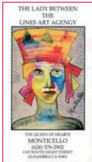
"Lady between the Lines"